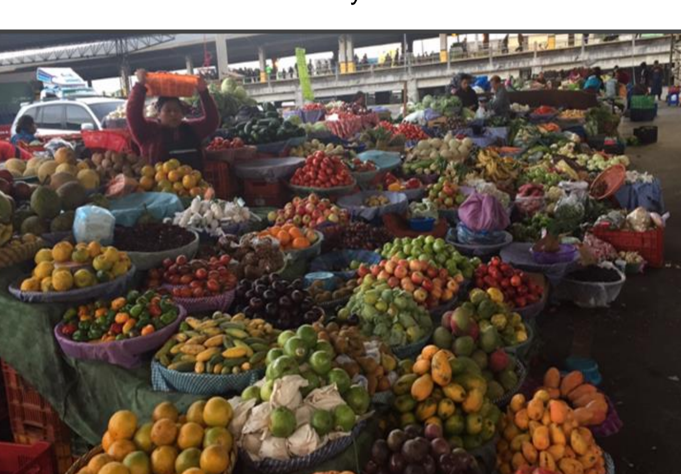
CENMA Produce Market Guatemala City, Guatemala 2/21/2018