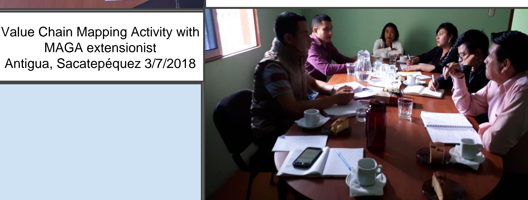
Interview with ASODESI and ASASAPNE coffee Associations San Pedro Necta, Huehuetenango 2/13/2018